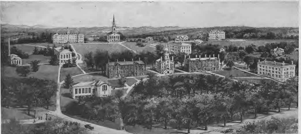
Middlebury College, 1921